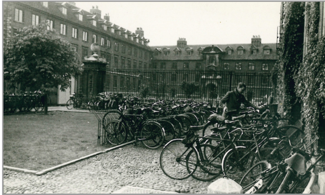
College frontage, c.1950-70