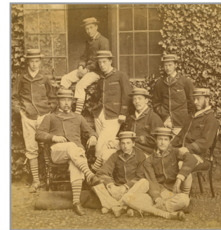
Rowing team, 1876