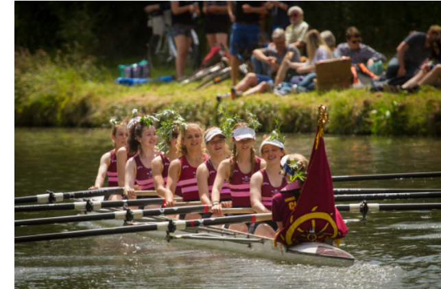
May Bumps, 2018

Today, St Catharine's is a thriving community comprising the Master, around 120 Fellows, some 230 graduate students and about 450 undergraduates. The College is committed to academic excellence and success, while maintaining a relaxed and sociable atmosphere.