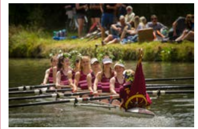
May Bumps, 2018

Today, St Catharine's is a thriving community comprising the Master, around 120 Fellows, some 230 graduate students and about 450 undergraduates. The College is committed to academic excellence and success, while maintaining a relaxed and sociable atmosphere.