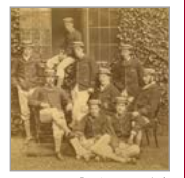
Rowing team, 1876